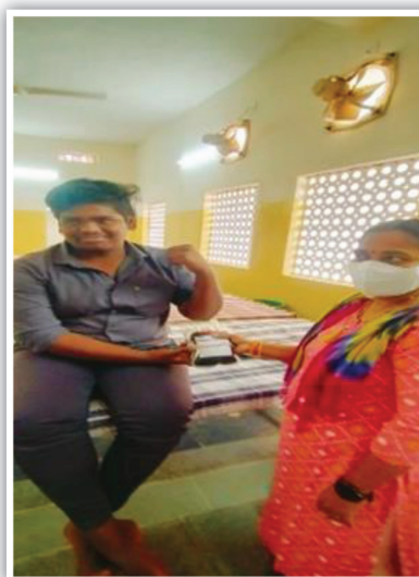
Students donating blood at the medical camp held on 21st december 2022