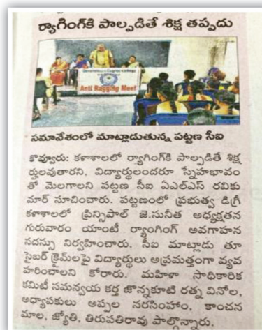
Anti-Ragging MEET by WOMEN EMPOWERMENT CELL

He also added that if any form of sexual harassment takes place in one's case, he/ she consult with law firm that handles sexual harassment. Sexual harassment at work place or at home is against the law and should never be tolerated.